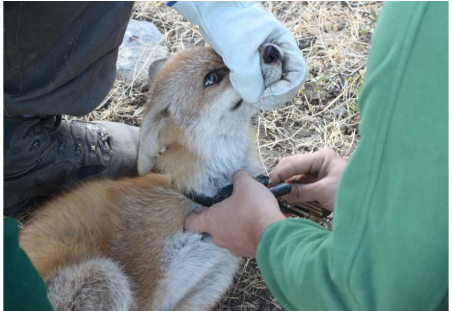
Field technicians fitting the GPS/GSM transmitter

This action aims to tag a specific number of individuals which will act as bioindicators of the illegal use of poisoned baits in its home range.