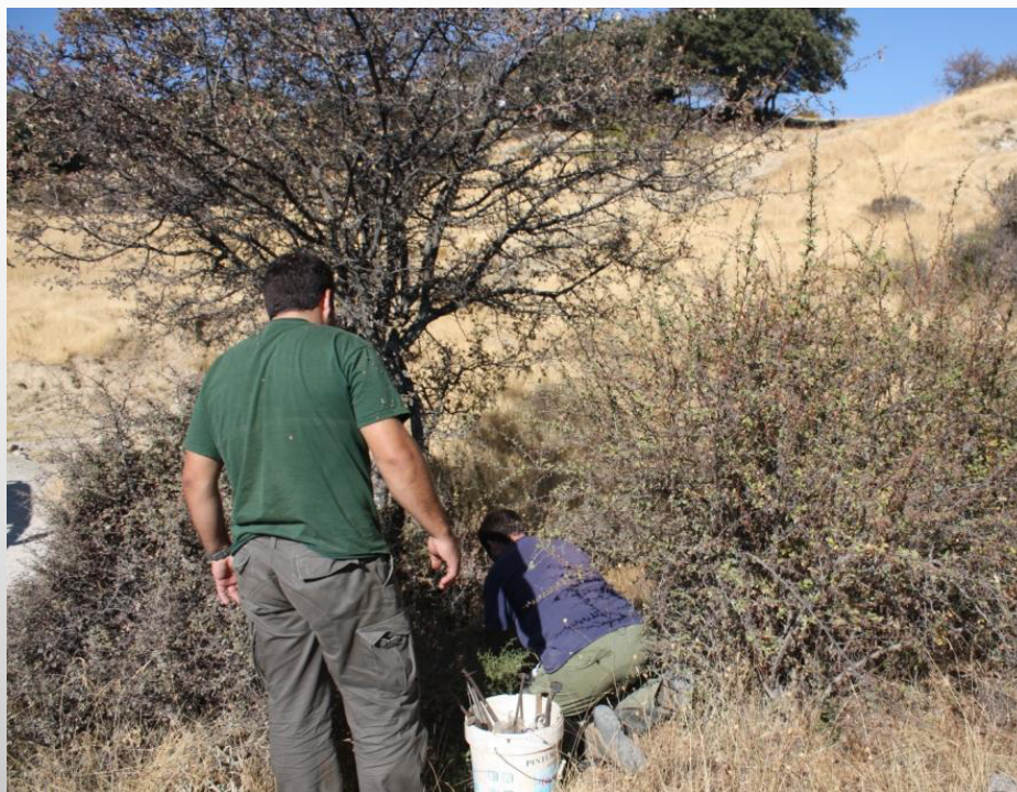
Technicians from Fundacion Gypaetus and Consejería de Medio Ambiente checking the area to place the experimental traps

Among other measures, one of the most remarkable is the experimental use of Collarum, a trap still to be approved by the EC which allows trapping foxes selectively without affecting other species. This first capture campaign is being carried out in two of the Spanish project pilot areas: Sierra Nevada (Granada) and Sierra Mágina (Jaén), counting with the collaboration and support of the Consejería de Medio Ambiente of Junta de Andalucía, based on its previous experiences using this trapping method.