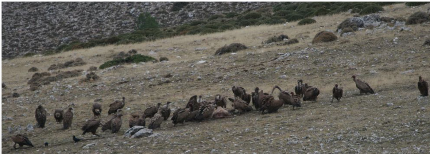
Griffon vultures feeding on carcasses in a feeding station

After ten years banned, it has been finally approved in Spain the Royal Decree which allows the deposit of carcasses in the field.